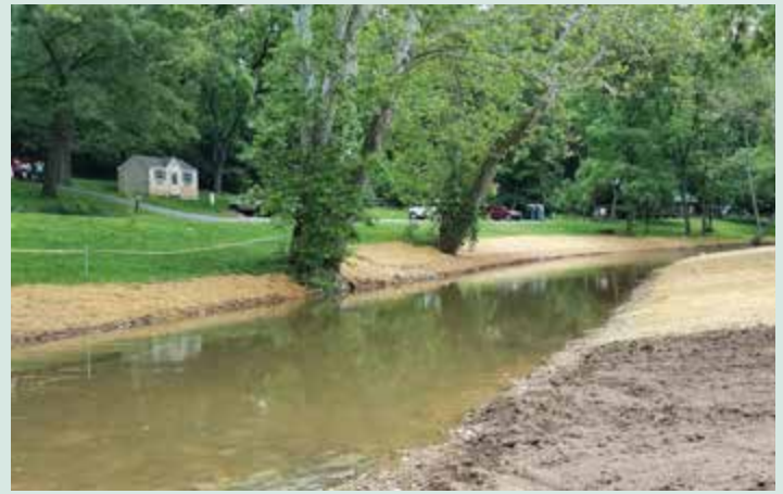
Conestoga River after project