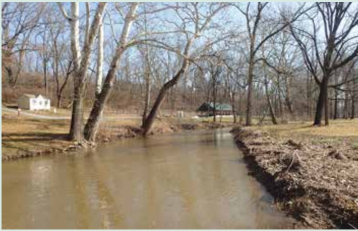
Conestoga River before project