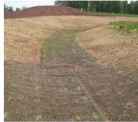
Correct Installation of Matting In a Swale