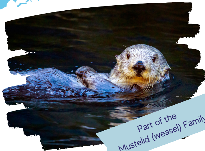
Part of the Mustelid (weasel) Family

Otters are extremely curious and playful and often slide on ice or snow, shoot down slick muddy banks into creeks, play with food, sticks and stones, and wrestle each other.