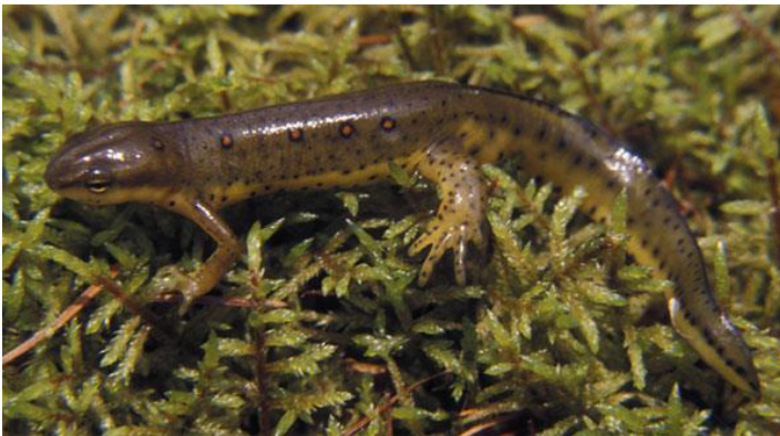
Top: sub-adult (eft), Bottom: aquatic adult

The red-spotted newt is actually the adult stage of an amphibian that progresses through a unique life cycle. At hatching, the larva is greenish-yellow with gills. Larvae eat aquatic insects, crustaceans, and the larvae of other salamanders. Two to three months into the larval stage, the forelegs and hind legs are developed, the gills are lost and the skin becomes rough. Next is the land-dwelling red eft stage, or sub-adult stage. The body becomes a brilliant orange-red. A row of black-bordered, round red spots appears on either side of the back; the belly is yellow. The red eft's bright color serves as a warning to predators that they produce a poisonous toxin that can kill small predators like mice. Toxins are produced throughout their life stages, but is at its strongest during the red eft stage. Red efts’ diet includes insects and snails.