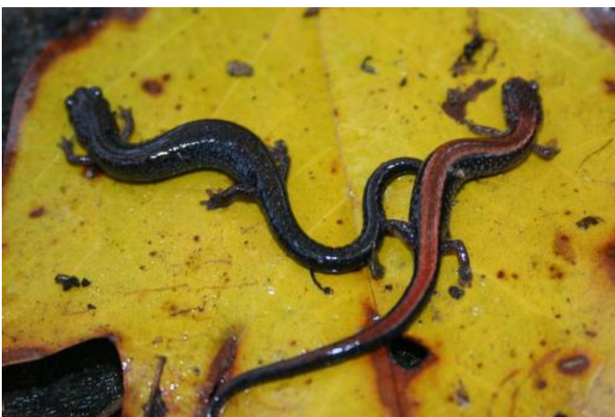
Unstriped Morph and Striped Morph

The Jefferson salamander is listed as a species of special concern in PA. It is highly sensitive to pollution, changes in pH, habitat disturbance, and habitat destruction. Like other salamanders, they are also killed by vehicles on roadways during the spring migration to breed in vernal pools.