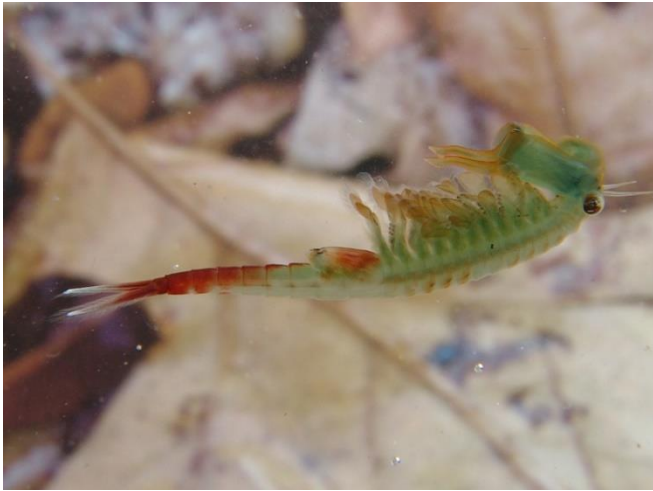
Springtime fairy shrimp (Eubbranchipus vernalis)

FAIRY SHRIMP: Fairy shrimp are crustaceans that are found exclusively in vernal pools. They are exquisitely adapted to this environment. They have no external shell, two compound eyes, and two sets of antennae. Their abdomen terminates with a pair of tail-like cercopods. They swim 'upside-down' on eleven sets of swimming legs that are also used to take up oxygen. They can withstand very low oxygen levels.