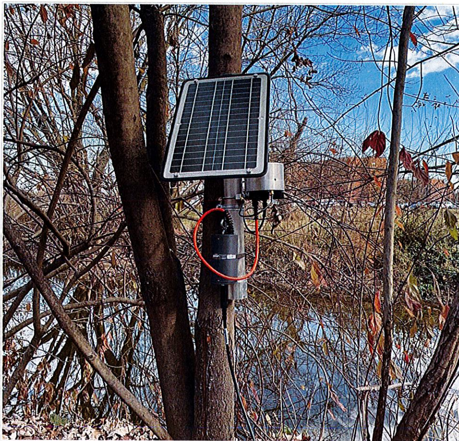
The first telemetry unit was installed at LCCD along Little Conestoga Creek.

Continuous data collection in Lancaster County, Pennsylvania, started about 5 years ago, and the county will be making a major upgrade over the next year—switching from relying solely on the internal storage of water quality sondes to telemetry units that enable real-time data viewing.