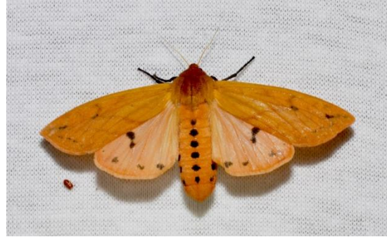
No difference in colors between adult male and female.

Diet: The woolly bear caterpillars and adult moth are known as generalist feeders feeding on leaves and herbs like dandelion, plantain, and nettle throughout the summer and fall.