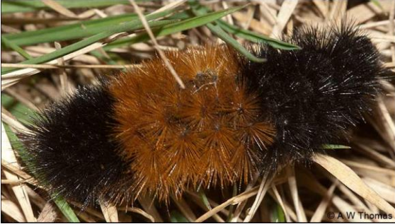
Woolly bear caterpillar

No difference in appearance for male or female.